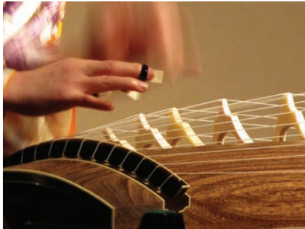
Kozue's fingers plucking the koto